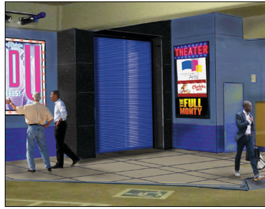
The portal walkway isn't the only upgrade this year outside of the Lesher Center. Coming later in 2018 will be construction for a new plaza out front, enhancing the theater-going experience.