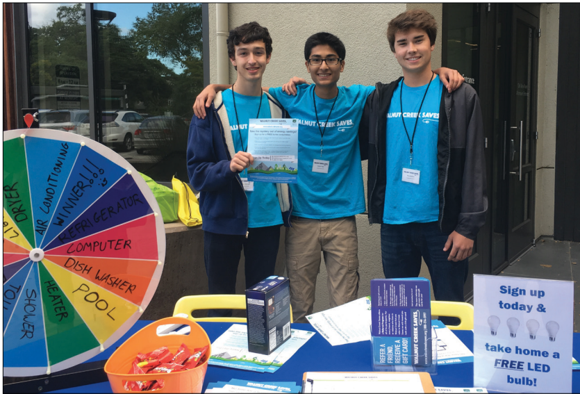
Conservation Coaches doing outreach for Walnut Creek Saves

Save water, save energy – and save money. Those are the goals of the residential efficiency program known as Walnut Creek Saves, and the program has been such a success that the City Council has extended it into the spring of this year.