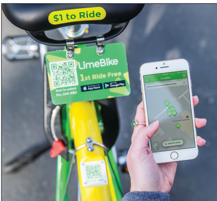
Rachel Capil, Rachel Capil Photography

If you see a bike that is on private property or blocking the right of way, reach out to LimeBike directly at: support@limebike.com , call 1-888-LIME-345, or text to 1-888-546-3345. LimeBike regularly deploys teams to recover bikes from stray locations and relocates them to higher trafficked areas. For additional information on LimeBike and updates on the bike share pilot visit www.walnut-creek.org/bikeshare .