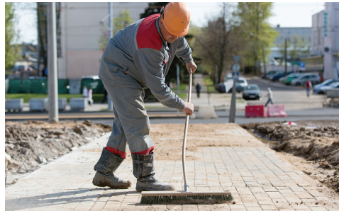
Example of dry sweeping.