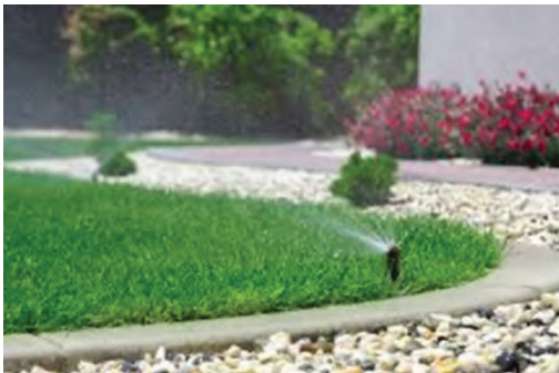
Proper irrigation waters plants; not sidewalks.