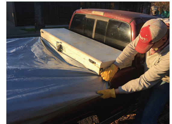
Properly tarped loads prevent flyaway material.