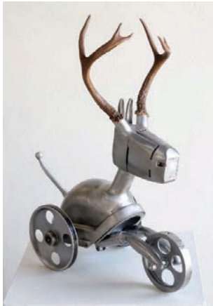
Nemo Gould, Impala, 2007, electric sander, band saw, projector, vacuum cleaners, meat grinder, motorcycle clutch lever, antlers, garlic press, conduit cover, 23 x 9 x 21 inches.