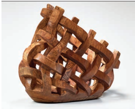
Sam Perry, Basket , 2021, wood, 29 x 38 x 23 inches.

In Walnut Creek, councilmembers are elected at large for 4-year, staggered terms; the next election will be held in November 2022.