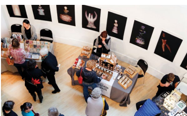
CRAFT FEST VENDORS CURIOWOLF, HANDBREWED SOAPS, AND CREATIVE PLAYWARE.