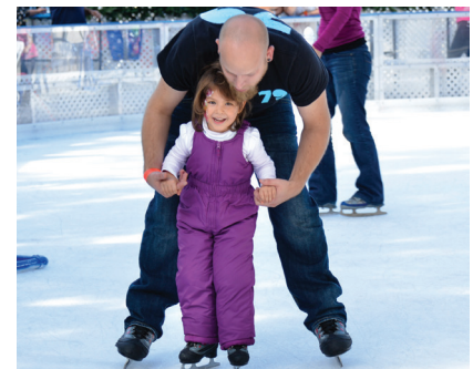
Walnut Creek on Ice is open through January 18 at Civic Park

The Clarke Swim Center at Heather Farm Park is open from noon to 4 p.m. Saturdays and Sundays for both recreational and lap swimming.