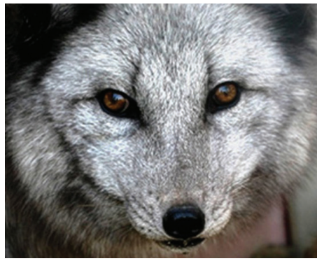
Meet an arctic fox at the Lindsay Wildlife Experience

Get up close to winter wildlife, from an arctic fox to a snowy owl, during the December edition of the monthly "Live.