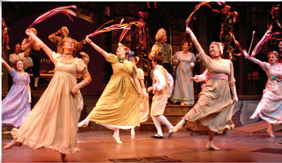
Spirits – of all kinds – soar at Center REP's beloved rendition of "A Christmas Carol," coming December 10-20 at the Leshner Center for the Arts.

DOROTHY SAID IT BEST – THERE IS NO PLACE LIKE HOME. As we wind our way through the final weeks of 2015, there is much to appreciate right here in Walnut Creek. Take a peaceful hike in the open space, lace up those skates at Walnut Creek on Ice, or treat yourself to a holiday tea at the historic Shadelands Ranch Museum or the Gardens at Heather Farm.