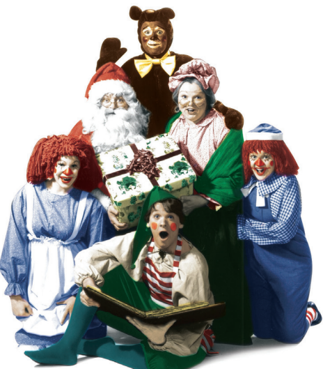
Fantasy Forum's "The Biggest Gift" at the Lesher Center for the Arts is a holiday treat for all ages.

Tickets available at lesherartscenter.org or 925-943-7469.